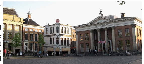
Odd Fellows Lodge Building in Amsterdam (central building in view)