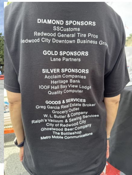
IOOF Bay View Lodge Silver Sponsor