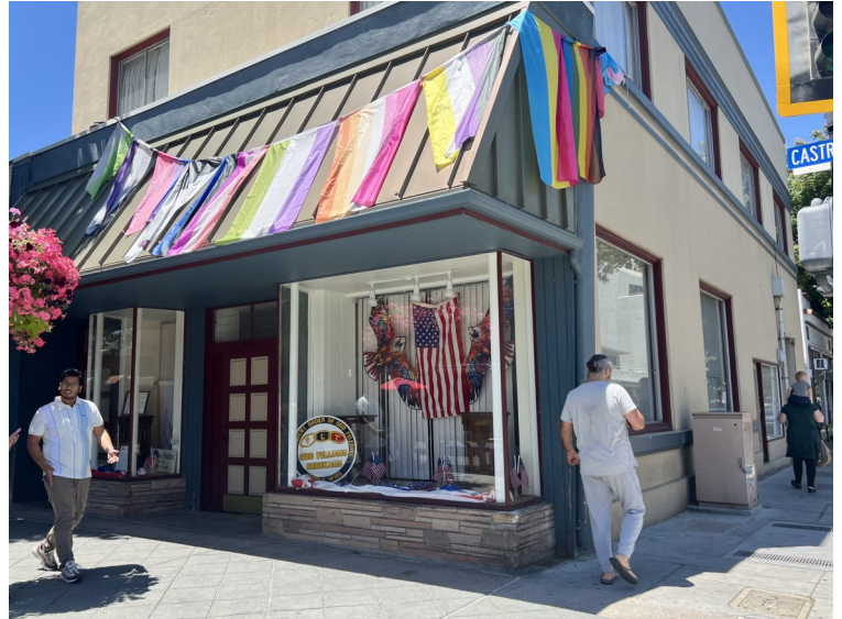
View from outside with the July Fourth display and pride flags