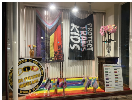
Pride Month window display for June at Mountain View #244